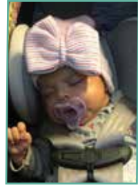
ARLETT October 15, 2024 6 lbs 14 oz