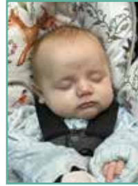
DORIAN August 28, 2024 6 lbs 2 oz