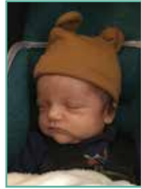
MATHIS October 27, 2024 6 lbs 14 oz