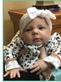
WRENLEY October 17, 2024 8 lbs 13 oz