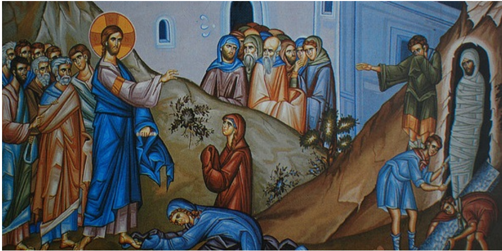
Photo: Flickr, Raising of Lazarus , posted by Ted, Creative Commons .