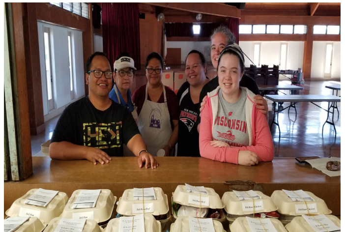
Members of the Church and Church friends shared time together preparing lunches for Habitat for Humanity workers in Waimanalo