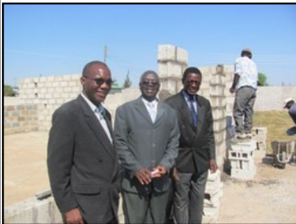
New friends and colleagues of CCAP Synod of Zambia

The Young Adult Volunteer program is moving forward. Four young women who applied were assigned to pioneer the program here in Zambia—and the folks here are excited and ready to welcome them. They will be working in various community schools associated with CCAP congregations around the city of Lusaka. They will be staying with host families, giving them the opportunity to truly become a part of a Zambian family and the local church community. It will be such a wonderful blessing for all involved.