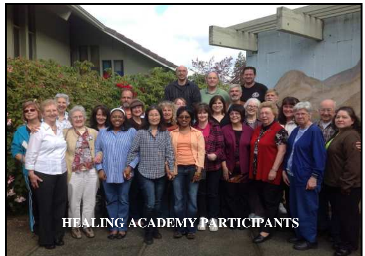
HEALING ACADEMY PARTICIPANTS

I wonder how many God-fearers who are out there now, would come to the place of wholeheartedly receiving Jesus as their Messiah and Savior! Come Holy Spirit! Wake us up! Do it again! Help us declare your wonders! LE