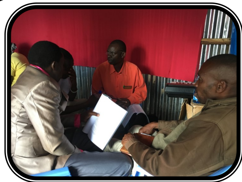
Small group time