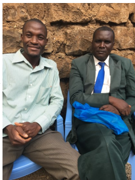
More participants in Healing Seminar

One Pastor wrote to us after he arrived back home, telling us that he had experienced the fruit of what God did at the seminar. He plans to help equip others in the Body of Christ so that the work God has begun will continue.