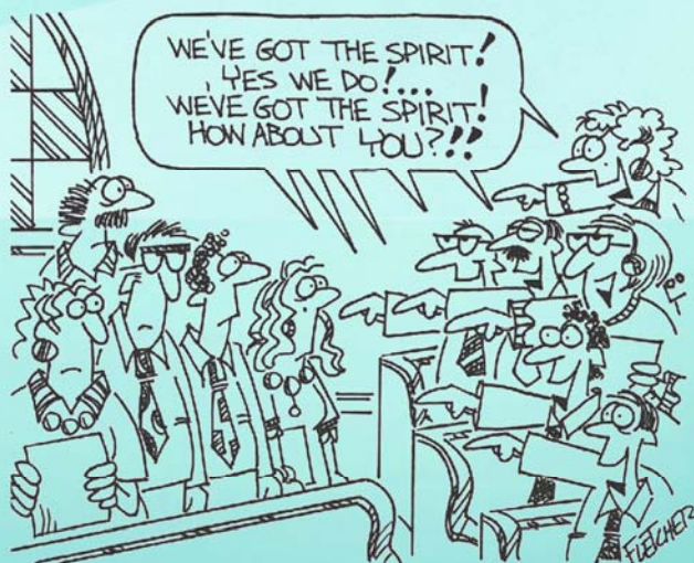
THE ONE DISADVANTAGE OF ADOPTING A MINISTRY TEAM APPROACH IN YOUR CHURCH

Motivating people vs. maintaining control. Teams unleash the three factors that motivate people—autonomy,