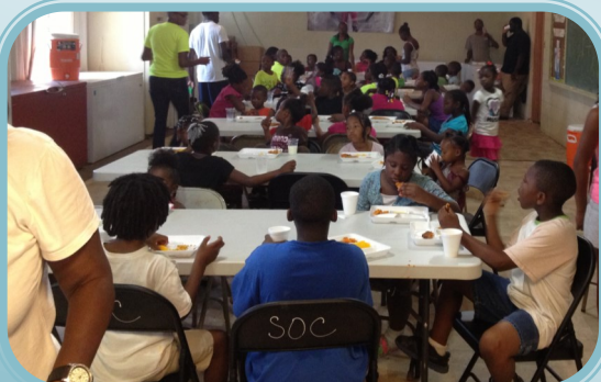
Participants enjoying a delicious meal in the dining area.