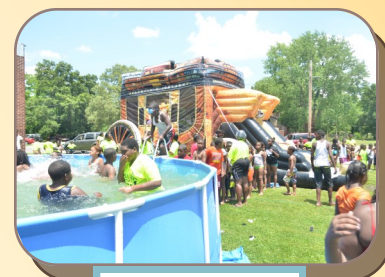
MBW-Save Our Youth Back to School Bash