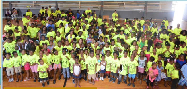
Children pose for group pic!