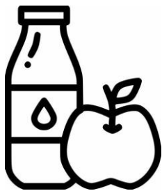
Food & Drink