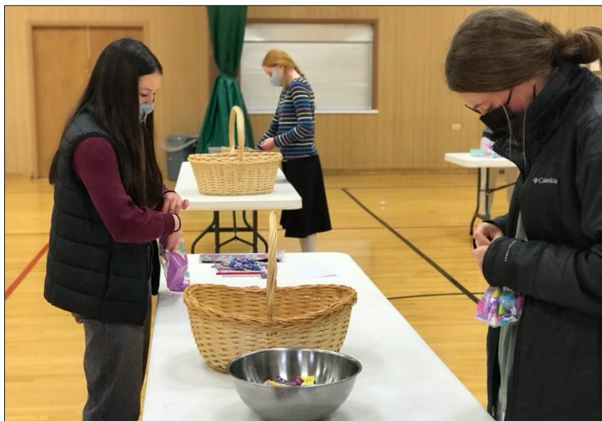
Valley Youth assembling Easter goodie bags for the Easter Egg Drive-Thru Event. See page 3 for more information.