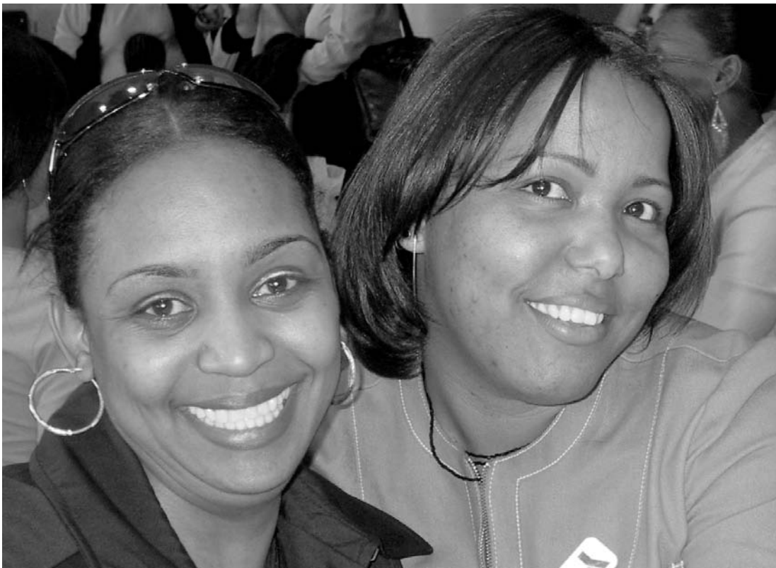
Greater Boston YMCA staff member with a parent.

The program's YMCA affiliation places it in a unique position to connect with a diverse group of families and community organizations. The program advertises workshops and events for parents offered by YMCAs in other locations. The program offers workshops for parents to support children's academics and refers parents who want or need such services to other resources beyond what the program provides.