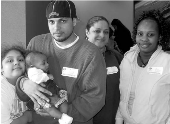
A multigenerational family from East Boston attends the Engaging Families Initiative Family Fun Night 2005.

This section presents four overarching strategies that after school programs can employ to engage families after school: