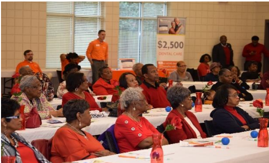
Senior Lunch & Learn Event