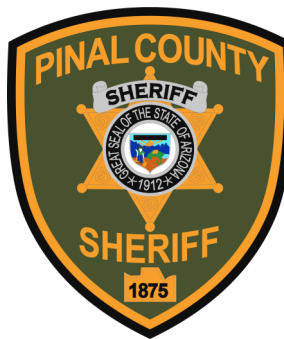
Pinal County Sheriff's Office