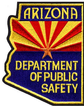
Arizona Dept. of Public Safety

A very special Thank you for these agencies great support!