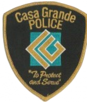
Casa Grande Police Department