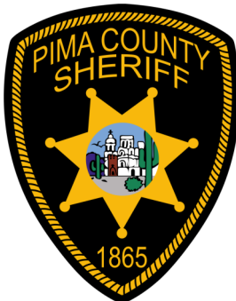
Pima County Sheriff's Office