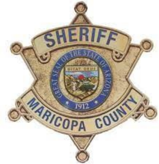
Maricopa County Sheriff's Office