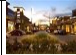
West End 2910 W Loop 289 Frontage Rd