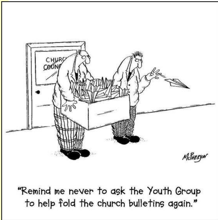
"Remind me never to ask the Youth Group to help fold the church bulletins again."