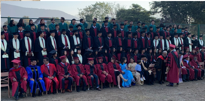
Right: the 2025 graduate class of the Bible College in India