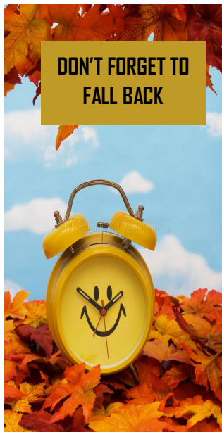
Daylight Saving Time Ends Sunday November 6