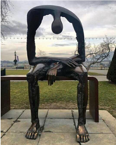
You don't have to face it alone. Stephen Ministry