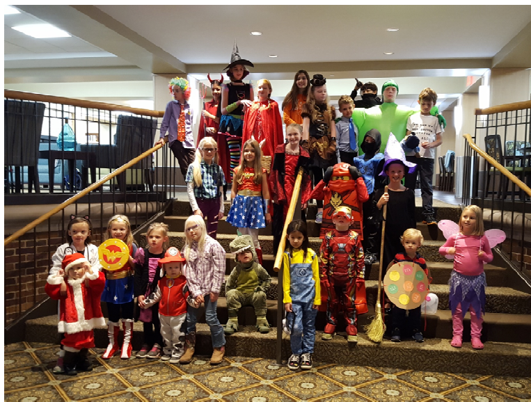
We has a BLAST at the Reverse Trick or Treating event at CRC!

We do offer an early shopping session of the bazaar for children and others who would benefit from a quieter shopping experience. It will be on November 30 th . Several adults and teenagers will serve as greeters, wrapping helpers and cashiers, and we hope to make this a special evening for children and their families. Your person can choose to have a shopping buddy or have a parent help them out with their shopping. http://www.signupgenius.com/go/20f0a44aeaa229-thursday