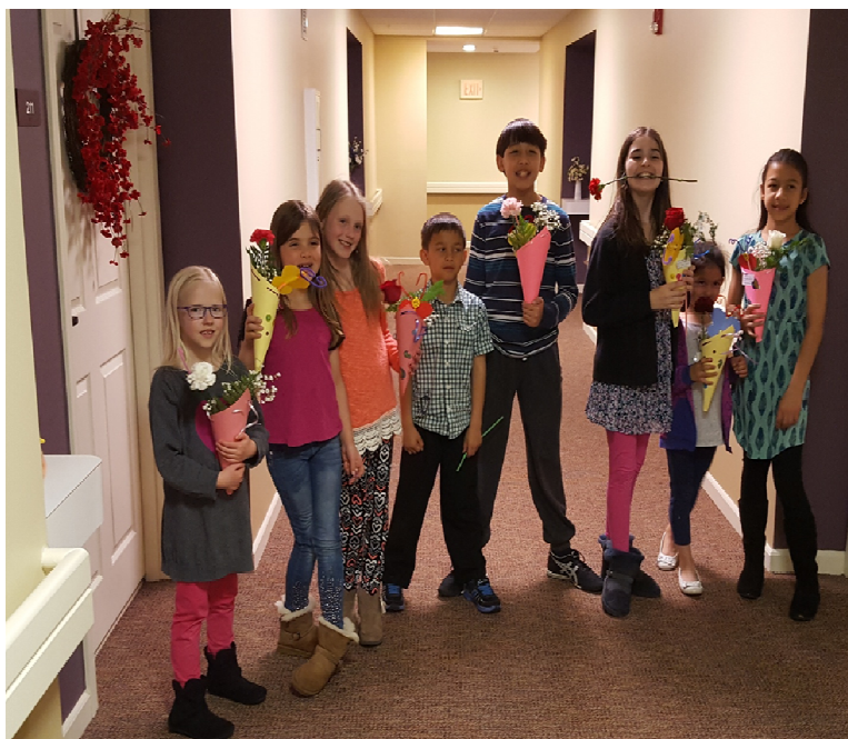
Delivering May Day spring flowers to the residents of the Pines!

We are looking to beef up the substitute list for childcare. If you or someone you know would be interested in helping with childcare but cannot make a regular commitment, please send Courtney the name and contact information. Childcare makes family ministries possible and family ministries are vital to the church!