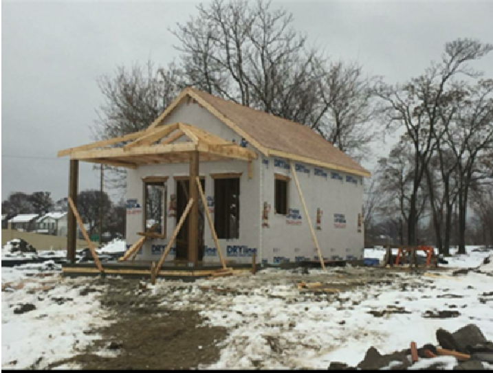
Cass Community Social Services Tiny Home #2

Coming soon: An opportunity to shop for supplies, make and serve a meal, or play with children after dinner.... an opportunity to simply offer hope through your very presence - March 20 th -26 th