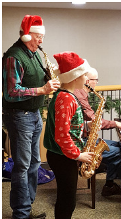
Christmas Caroling at Chelsea Retirement Community 2016