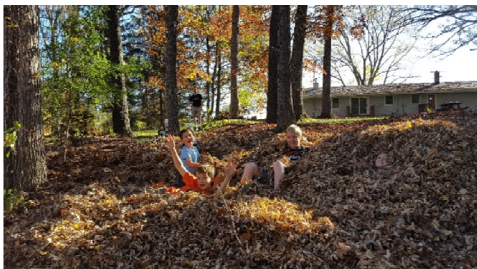
BLAST Leaf Raking (playing) 2016!!