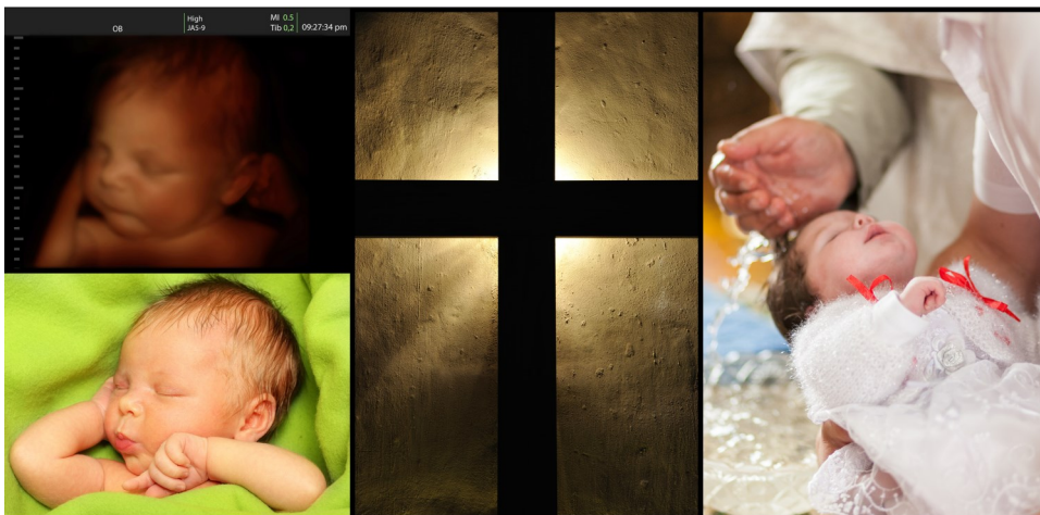
"But now thus says the Lord, he who created you ... 'Fear not, for I have redeemed you; I have called you by name, you are mine'" (Isaiah 43:1).