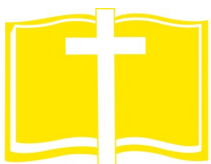
To Know Him

*Please note that public testimonies & interviews may appear on our weekly podcast.*