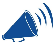
To Make Him Known