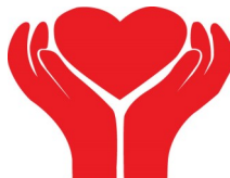
To Share His Love