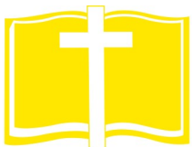
To Know Him

*Please note that public testimonies & interviews may appear on our weekly podcast.*