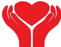
To Share His Love