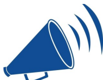
To Make Him Known