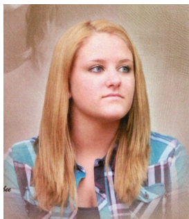
Ashley Carole Burbee Memorial Scholarship