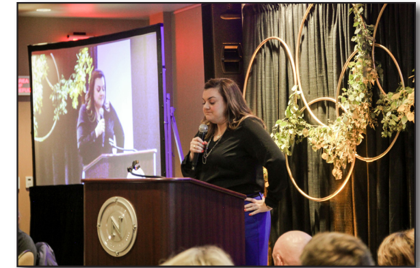
Abby Johnson, President and Founder of And Then There Were None