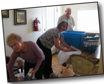
...A Case for Life In Our Own Backyard continued from cover