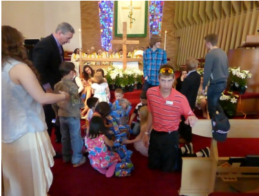
Kids help weigh the 223 pounds of coins that was received on Easter Sunday for the annual One Great Hour of Sharing offering. Thanks to all who gave!

The foods that are most requested are things with pop-tops that don’t need can openers. Things that are nutritious and include different food groups are great. Canned vegetables, soups, meat, and pastas are very welcome. Instant and dehydrated foods such as tuna helper, mashed potatoes, mac and cheese are good. Also things like peanut butter, jam (in plastic squeeze bottles), crackers, fruit cups, granola bars, and packets of hot coco are great. We have a complete list on the mission bulletin board.