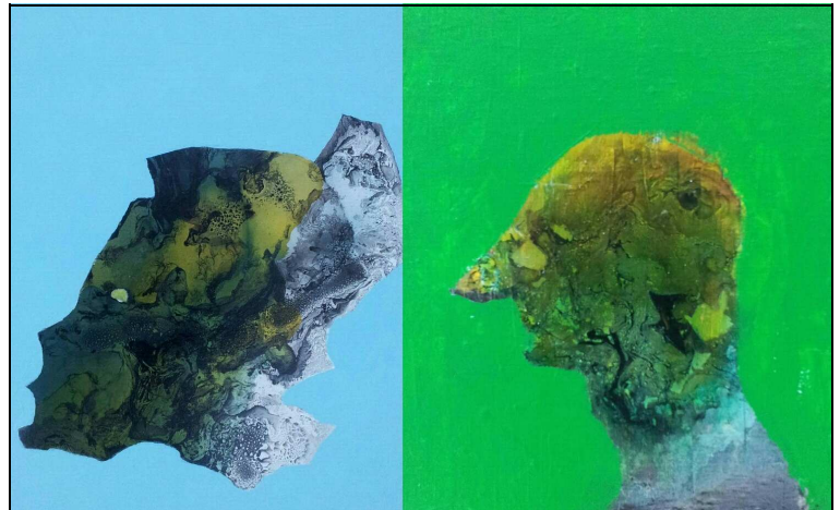
Head Games exhibit opens at Stone Village Church on April 1.