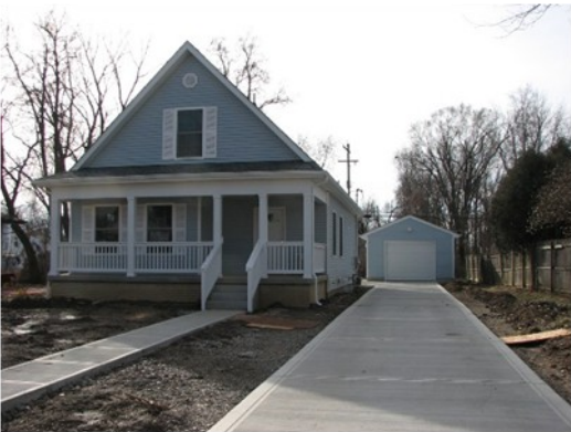
2015: New Home on Genessee Ave.

Hilliard Adopt A House (HAAH) was formed in 1996 and to date has built 11 new homes and has rehabilitated 10 additional homes, all in Central Ohio. Some of the home rehabilitations have been houses that were originally built by Habitat for Humanity many years ago. When life situations force the Habitat families to vacate their houses (family deaths, loss of jobs, etc.) HfHMO, who holds the unpaid titles to the homes, often needs to bring the houses up to current building codes in addition to installing modern appliances and energy saving features. Other houses that are rehabilitated are abandoned properties that have been taken over by the local municipality and given to HfHMO to make habitable once again.