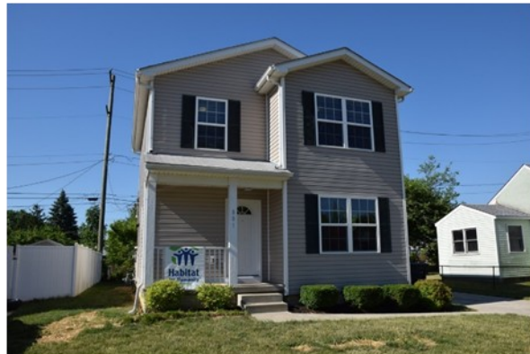
2016: First Remodeled Home on Bellevue Ave.

The new home that was constructed in 2015 required almost 3900 hours of volunteer labor. Twenty One KAUMC volunteers donated 701 hours toward this effort. HAAH spent over $50,000 to make the family's dream of safe, affordable housing a reality.