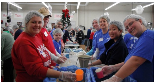
Volunteers from Faith join together on a packing line at Hands Against Hunger November 2016.

Look for a signup sheet on the Social Concerns table in Narthex!