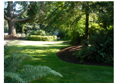
Take a stroll thru our beautiful Farrar Park located just across the street from the church. Open to the public at all times.

SHARING THE LOVE OF GOD AND MAKING DISCIPLES FOR THE TRANSFORMATION OF THE WORLD