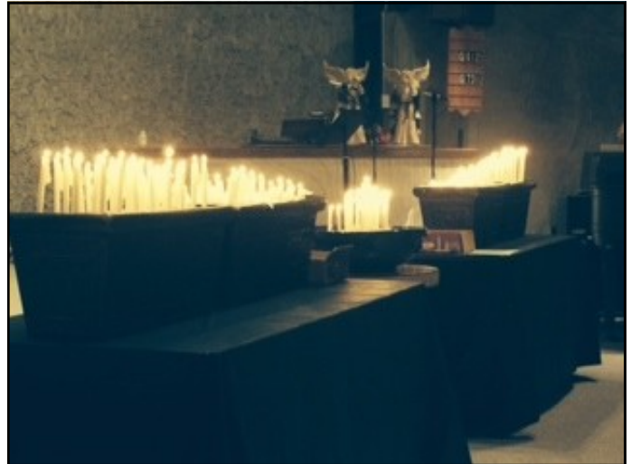
September 2014 Service of Remembrance

317-926-5371 churches@churchfederationindy.org