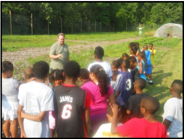
2013 Summer Gardening Project