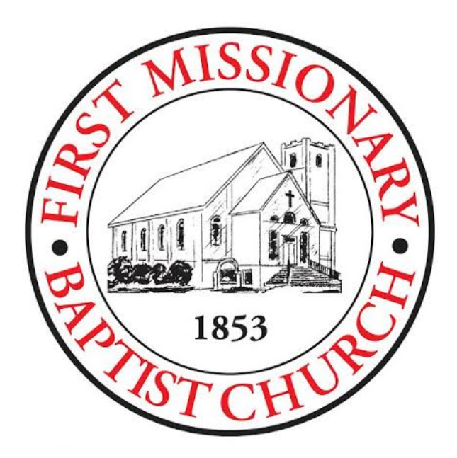
Mission Statement: To Be Christ disciples in spreading the Gospel of Jesus, loving our neighbors, and advocating justice; as we share Christ with one another.