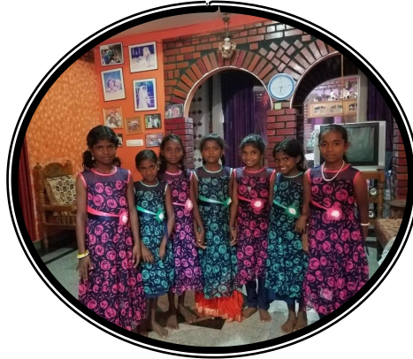
Girls in their costumes

children that perform during our Christmas program. This year God blessed our youth girls because we found dresses on sale at a local shop – marked down from Rupees 2,000 = $31.25 to Rs 400= $ 6.25. God has been so faithful and gracious. Glory to God! A local tailor is currently working on the shirts and pants for the boy's.