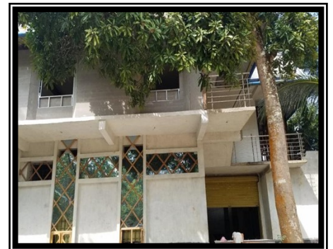
Outside of church

Thanks for your support at this time. We are excited to see the hand of God. From the 13th to 17th of November 2017 was our fasting and prayer for Christmas. And from the 20th to the 24th of November 2017 we taught at a Discipleship Training School for Youth with a Mission in Calicut.