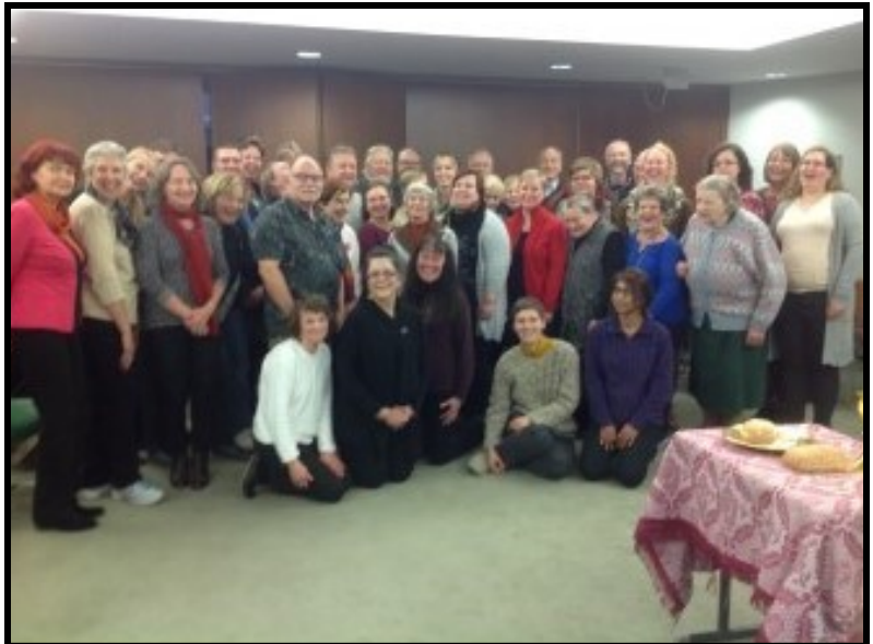
The Participants in the Healing Seminar at the Tallin United Methodist Church. There were forty two persons who attended the full seminar with others there part time.