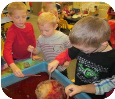
Winter week - ice sculpture melting with salt and colored water.