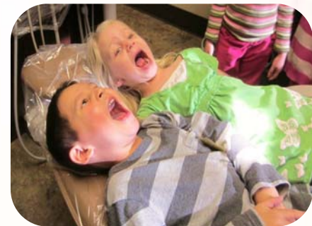
Open Wide! At Nature's Way Dentistry.