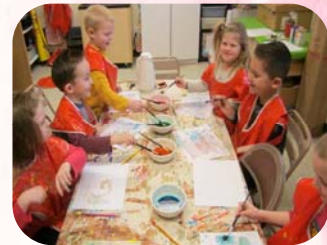
Another fun five senses day learning about the sense of smell and painting with fruity scented jello.