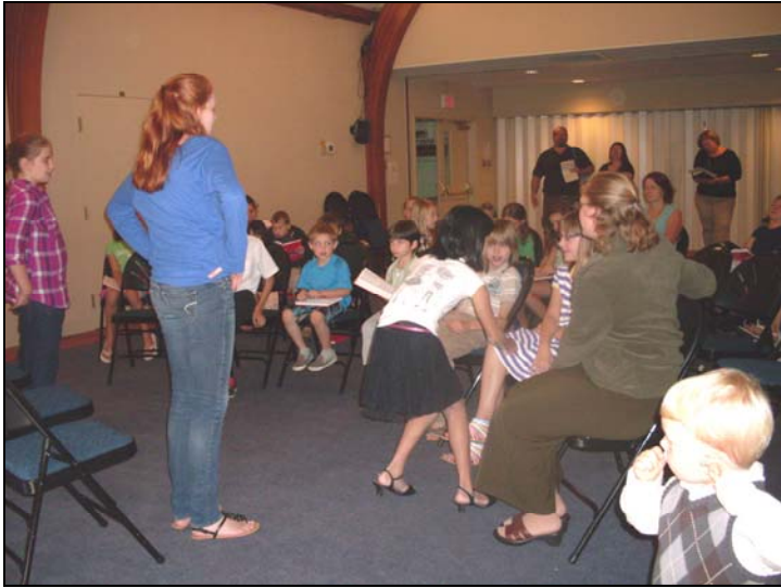
Music Time for children of all ages on Sunday.