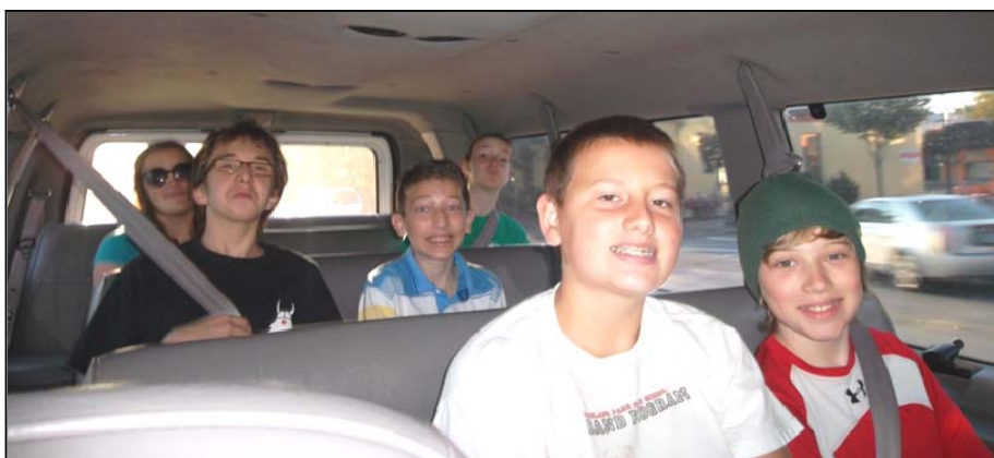
Left: Welcoming our new 6th graders during the "6th Grade Sneak" in September!