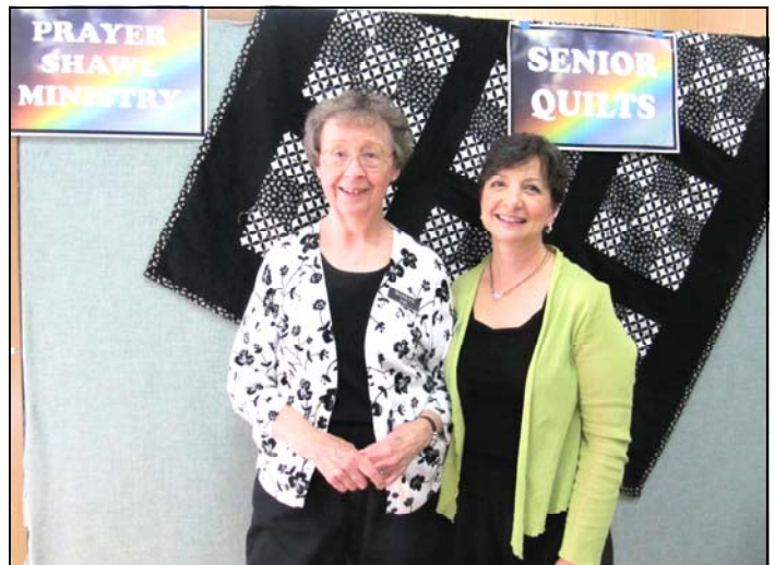
Many of Valley's ministries were on display at this year's Fall Kickoff.