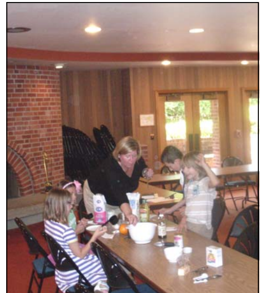
Children cooking as part of the Creative Classroom Circuit at Sunday School.