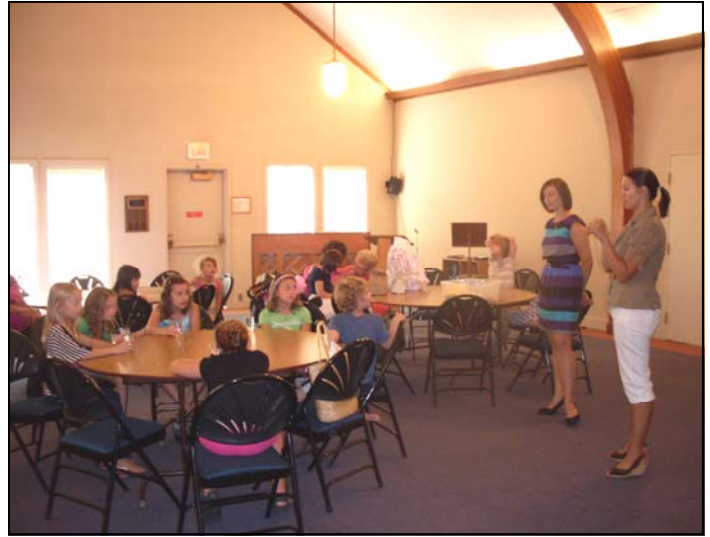
Acolyte training in Armitage Hall.