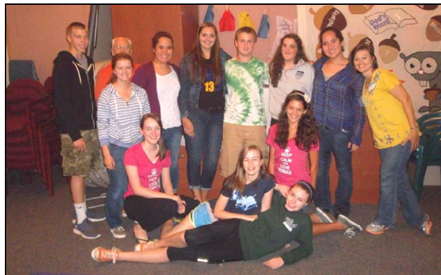
Gathering of High School Youth and Adults at a FAMILY Meeting in September.