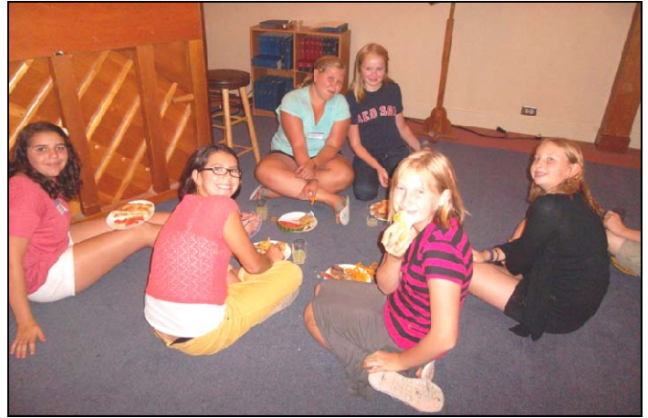
Middle School girls enjoying dinner in Armitage Hall during a Wednesday night LIFE meeting. Each week, the Valley youth in 6th-12th grades enjoy a meal together.