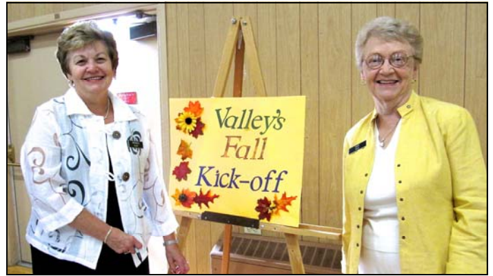
Above and Left: Valley's Fall Kickoff featured ways to get involved with the many programs Valley offers..