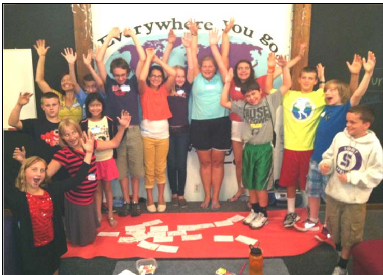
Youth at a Middle School LIFE Meeting in September. “We all belong to the body of Christ!”

SCRIP gift cards, sold by the Valley Youth on Sunday mornings during coffee fellowship, are an easy way to continue spending money as you usually do (on groceries, at restaurants, on an oil change, car wash, etc.) while also supporting youth mission. SCRIP gift cards give you 100% of what you pay toward the stores you choose (for your own shopping or for gifts to others), but the Valley Youth receive a portion back for the “Youth Mission Fund.” Come visit our table on Sunday mornings in Davis Hall/Gym to place an order for pick-up the following week, get more information, or even purchase a card if they are available. Thank you for your support!