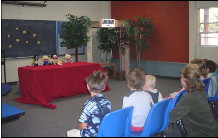
A puppet show was offered to the children of the Sunday School Creative Classroom Circuit.