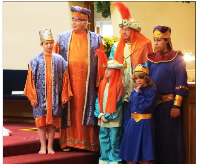
Three Kings with their Trainbearers at the Pageant of the Holy Nativity.