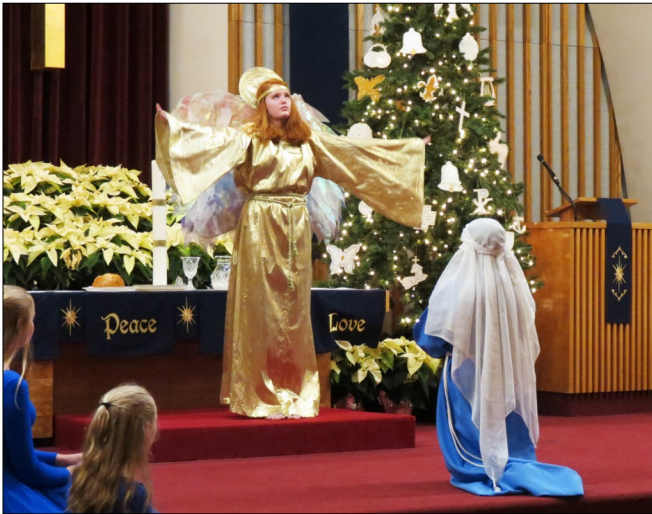
The Angel of Annunciation brings good news to Mary during the Pageant of the Holy Nativity.