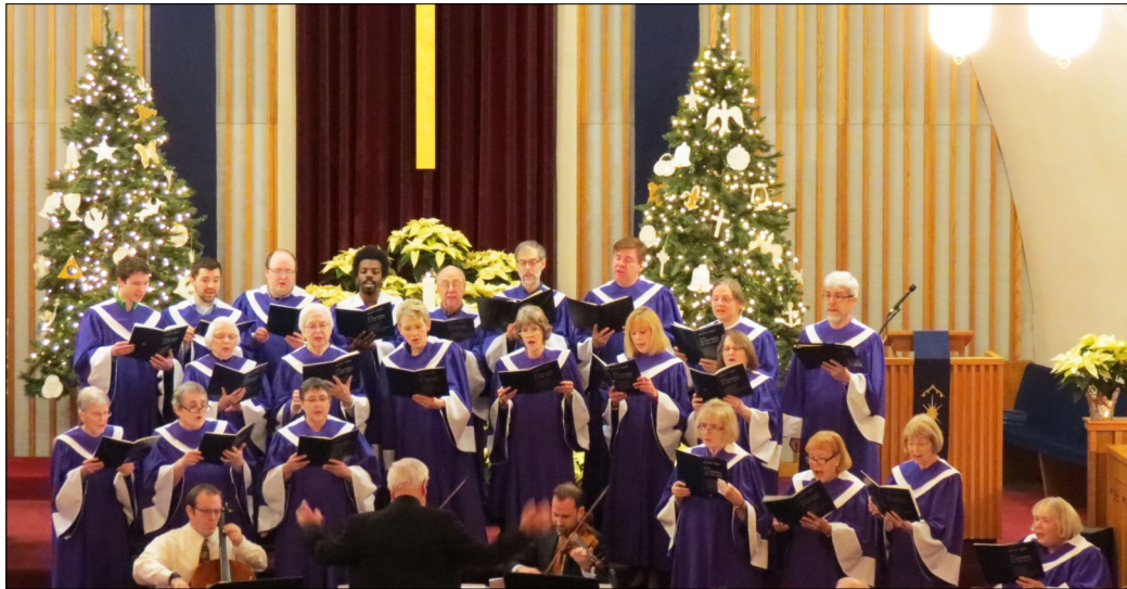
The Sanctuary Choir's melodic voices are joined by cello and violins to present Haydn's "Run Ye Shepherds to the Light."