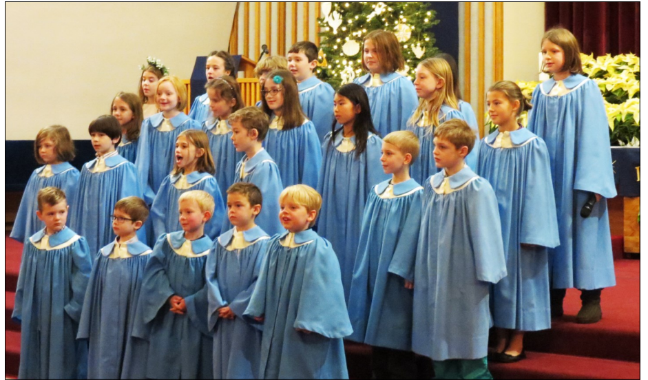
Combined children and youth choirs sing during worship.