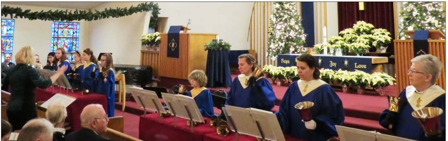
The youth and adult bell choirs play during Sunday worship.