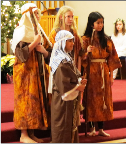
Shepherds stand watch during the Pageant of the Holy Nativity.