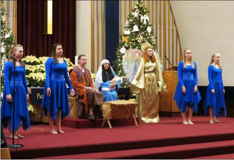
The Angel of Annunciation and Mary's Angels stand with the Holy Family during the Pageant of the Holy Nativity.