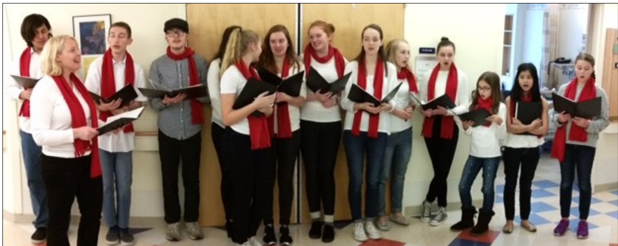
The Youth Choir sing at Doernbecher Children's Hospital.