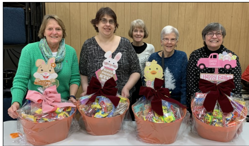
New Narratives Easter baskets

Each and everyone of you should be proud of what we accomplished in April. We collected 183 pounds of food and pounds of Styrofoam on the first and third Thursdays. We served dinner to 65 men at the Bud Clark Commons. They are now up to 75% capacity. We collected