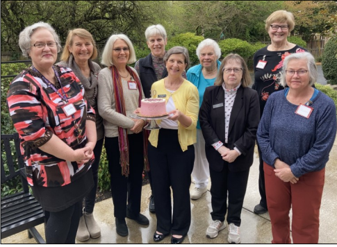
Together Women Rise participants celebrated their 10th anniversary in April.

Valley's chapter of Together Women Rise will meet on May 15 to learn about this month's featured grantee called Yamba Malawi and their program called Meeting the Needs of Young Mothers and Ending Childhood Poverty in Mangochi, Malawi. Their mission is to uplift vulnerable children by empowering their communities to break the cycle of poverty through a holistic, child-focused poverty graduation program.