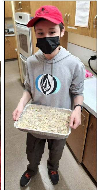
Scout Troops 797 and 799 prepared the meal for April's Soup Kitchen at the Bud Clark Commons.