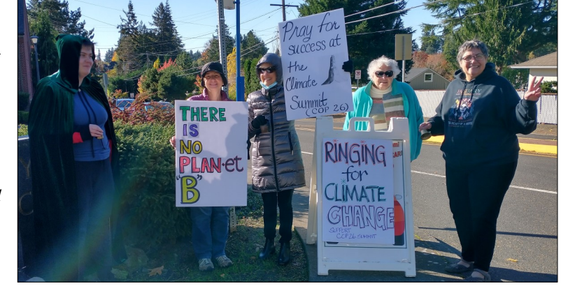
Valley family and friends joined the Earth Care Team and rang bells to support climate action and the UN Climate Change Conference.