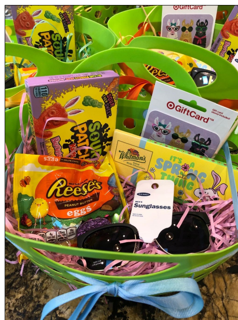
Baskets were filled with goodies!