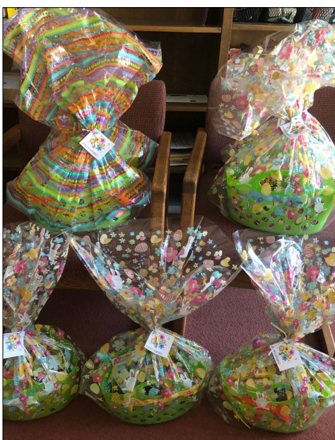
Easter Gift Baskets put together for Second Home students.