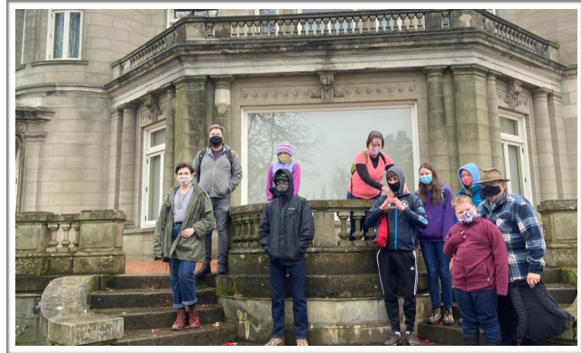
Valley Youth Hike to Pittock Mansion on February 6.

Subscribe to our blog, valleyyouth.org , for regular updates on who we are and what we're doing!