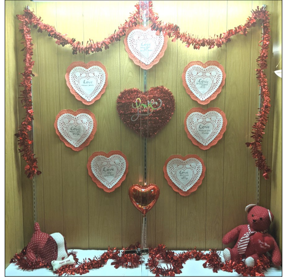
The display case in Valley's east hallway is always beautifully decorated thanks to Barbara Symons.