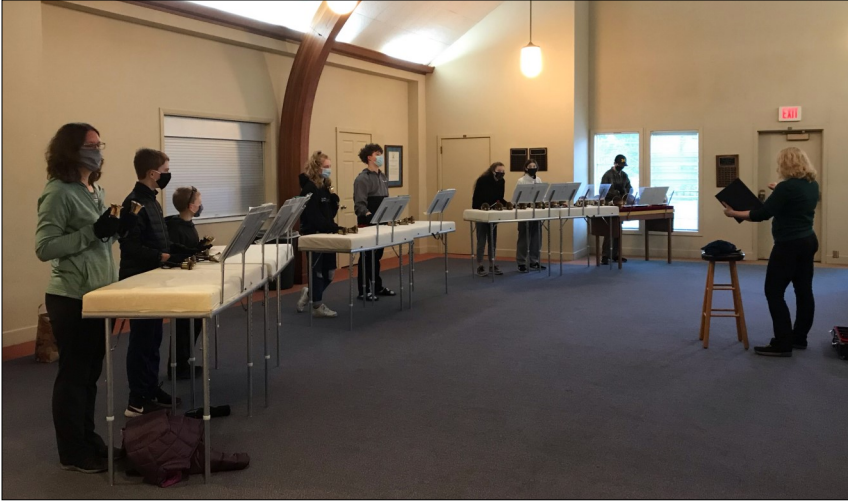
Socially distanced bell choir is currently happening for our youth (with some parent participation!). Family groups are spaced apart from each other and each family group gets a group of bells. It's a fun challenge as each player ends up having to do extra parts to make the whole song work! The group will perform during the livestream on Youth Sunday which is March 14.