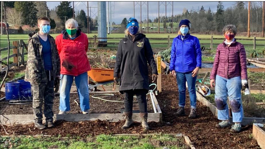
Valley's Earth Care Team volunteered at Bethany Lake as part of the nationwide Day of Service in honor and celebration of Dr. Martin Luther King (MLK) Day. Volunteers helped weed and mulch the community gardens.