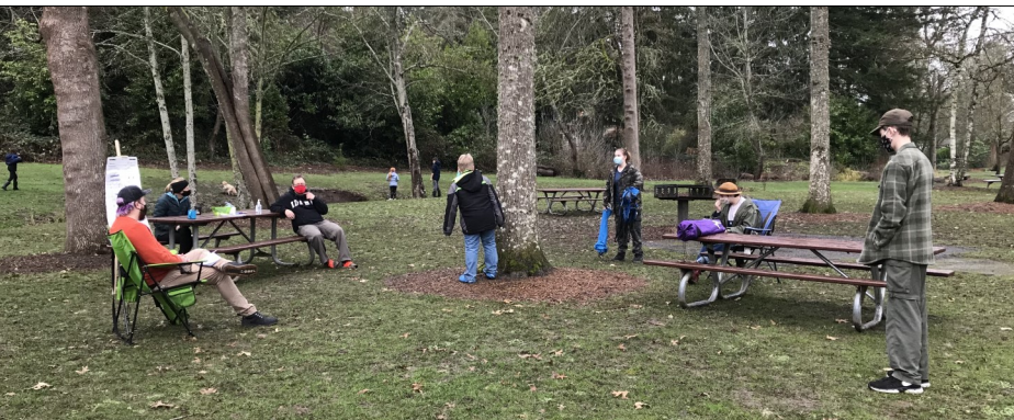
Youth enjoyed some fresh air at the park during a recent Valley youth group meeting.

Styrofoam is collected every first and third Thursday of the month as well as non-perishable food items like peanut butter, jelly, canned meat/tuna, school snacks, etc. Drop off your items in the East/back parking lot 10:00-11:30 a.m. Styrofoam items we are collecting are: