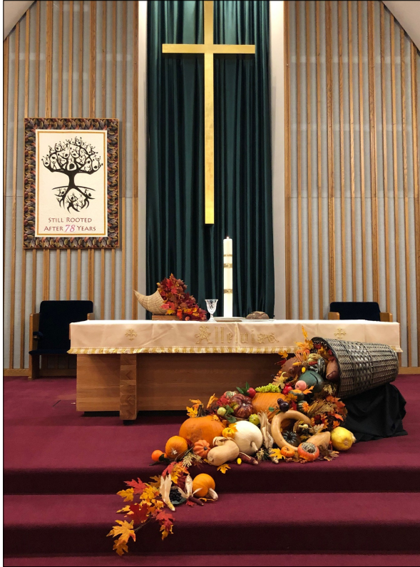
A cornucopia graced the sanctuary for Thanksgiving.