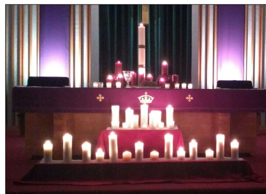
Beautiful candles were lit for the Ash Wednesday worship service.