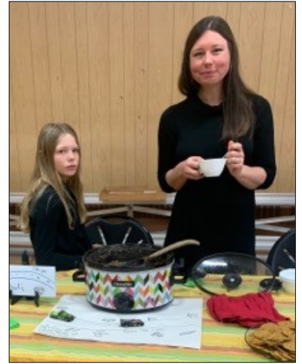
The annual chili cook-off was a big hit! Thank you to all who participated and to those who helped make it a success!