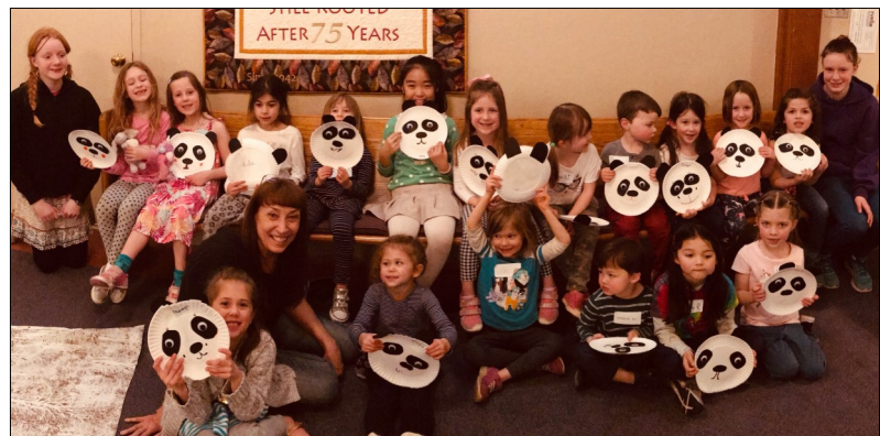
Kids with their panda bear craft at Kids' Night Out.