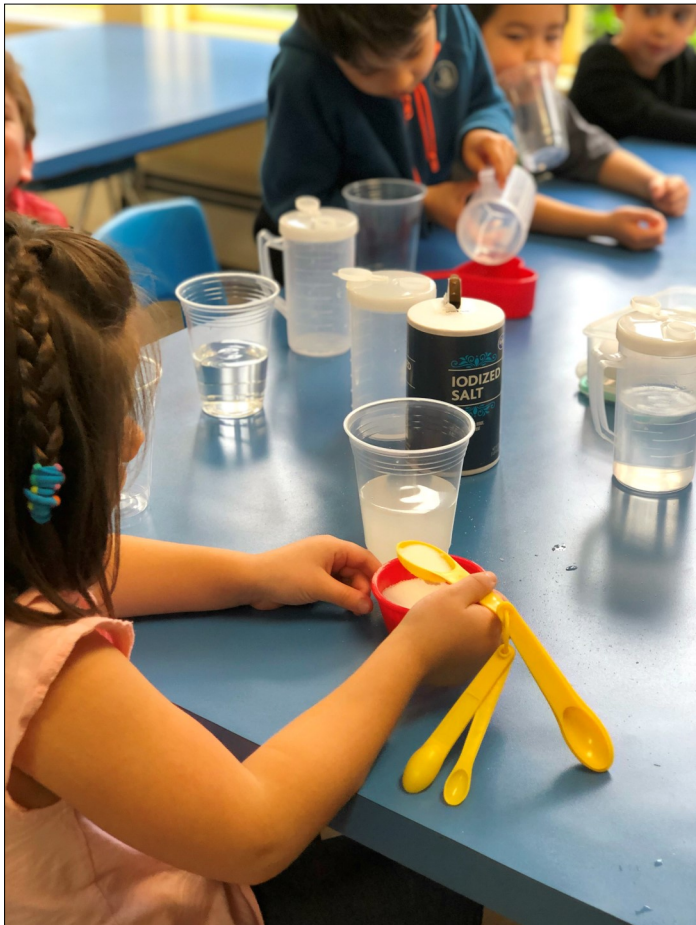
A hands on science project.