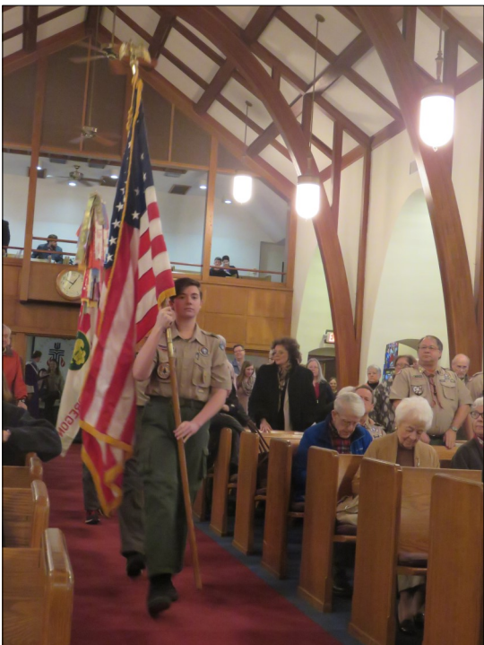
Above, left, and below: The Scouts (boys and girls) were celebrated during worship on Scout Sunday.