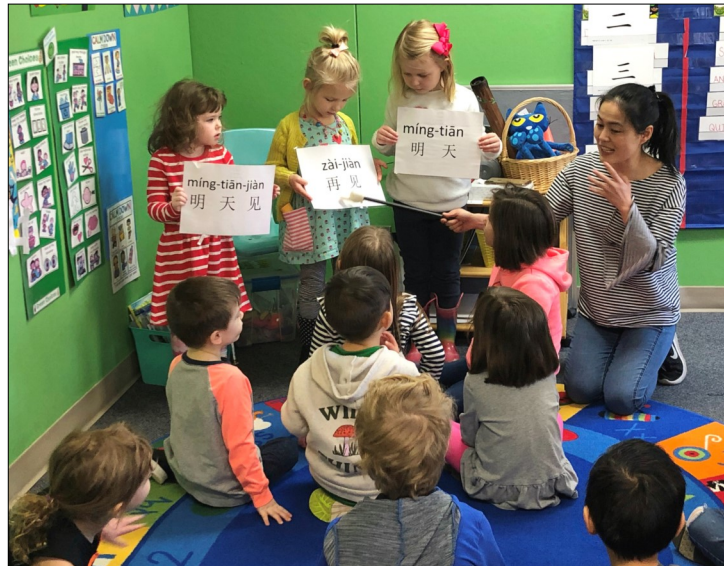
The children learning Mandarin.