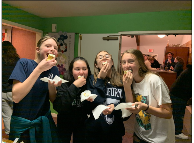
Right and above: The Youth enjoy cheese sandwiches and tomato soup made by Chef Roy followed by cake for dessert.