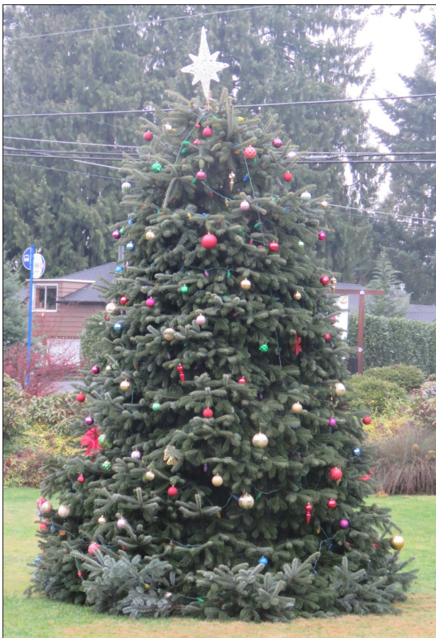
Above: The large Blue Spruce Christmas Tree on the front lawn of the church.