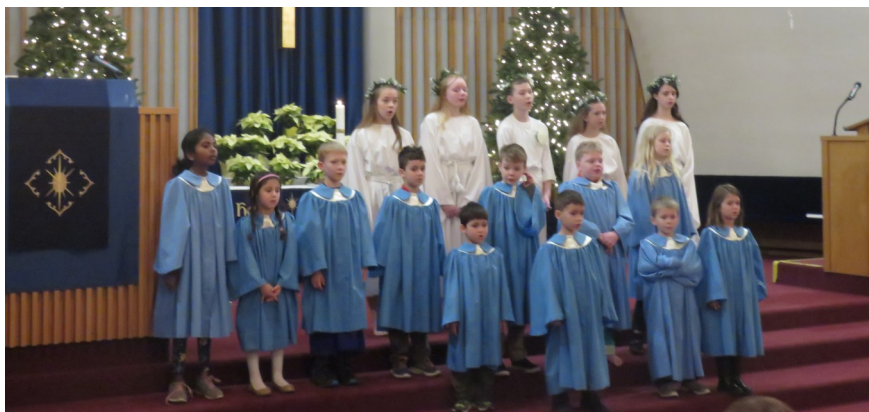
Below: The Youth Choirs along with Angels sing during the pageant.