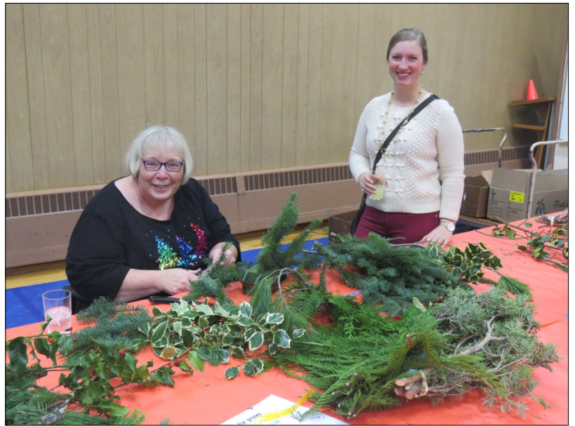
Greens were available at the Advent Fair for people to arrange wreaths and swags.