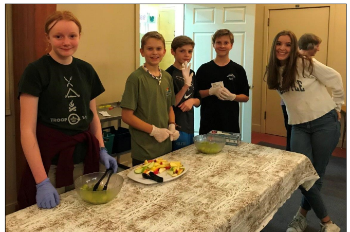
Valley Youth help serve dinner at Kids' Night Out.