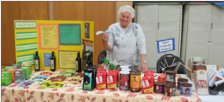
One of the many displays at the Mission Market.