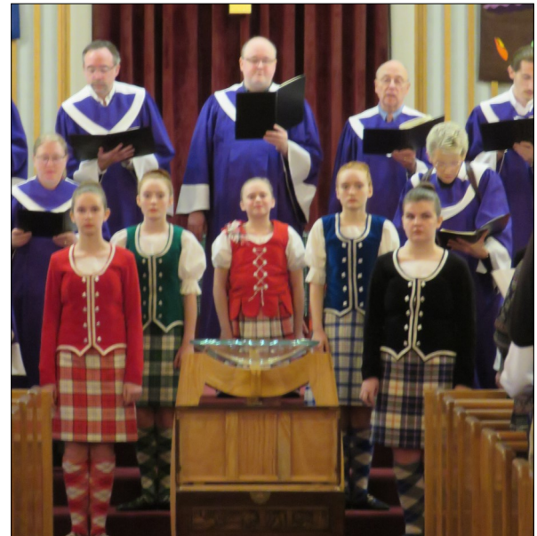
Celtic dancers join the Sanctuary Choir at the front of the sanctuary during Kirkin' o' the Tartan Sunday.