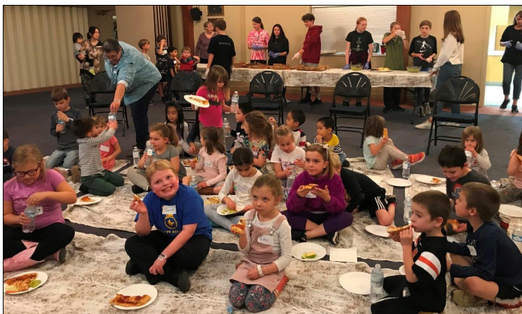
The children enjoying a meal and movie at Kids' Night Out.