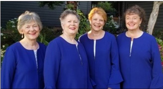
Moonglow Barbershop Quartet to entertain at Senior Lunch.

'Tis the season to celebrate the birth of our Lord and Savior by gathering together to eat, sing and be merry! Please join us on, Thursday, December 12, in Armitage Hall for the annual Senior Christmas luncheon. Moonglow, a barbershop quartet that has been singing together and competing for the past three years, will entertain us with Christmas music and a sing-a-long. This quartet is part of the top 10, internationally famous, Sweet Adelines Chorus in Portland. Plan to be there to tap your toes, sing along and welcome Moonglow to Valley. The Lunch Bunch children from Valleys Preschool will greet us with a couple of Christmas carols as we gather at noon for a delicious meal. Their sweet voices have been a part of the annual Christmas luncheon for many years. Thank you Lunch Bunch kiddos! The Senior Lunch Kitchen Crew can't wait to greet